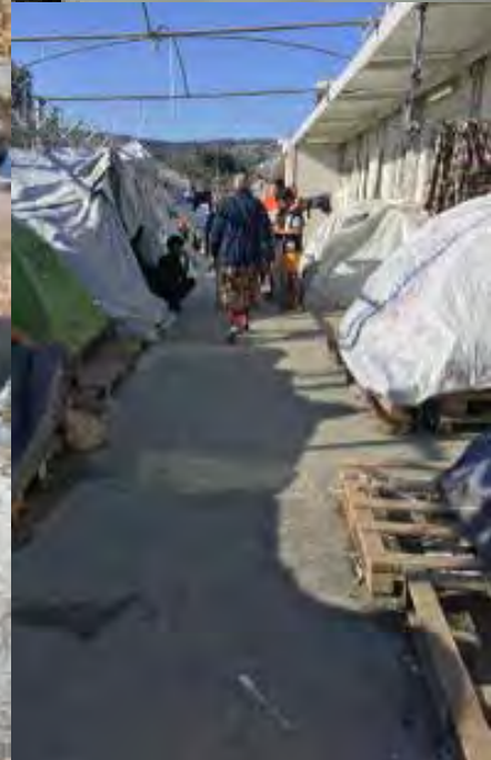
2018 Moria Refugee Camp, Lesvos, Greece