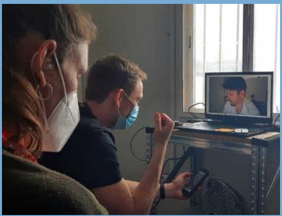
TELE-HEALTH Collaborating with the University Medical Center of Vienna, we set up and monitored this very useful program