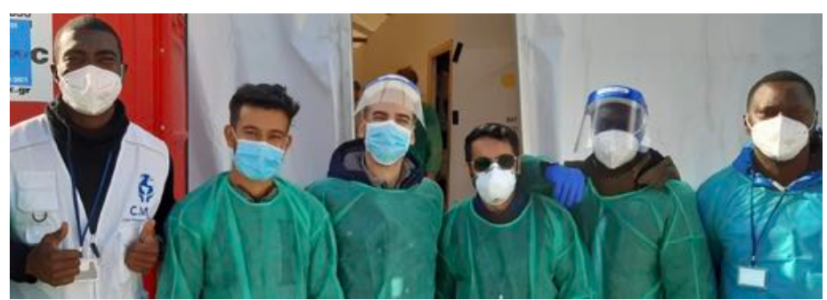
A few of our dedicated translators