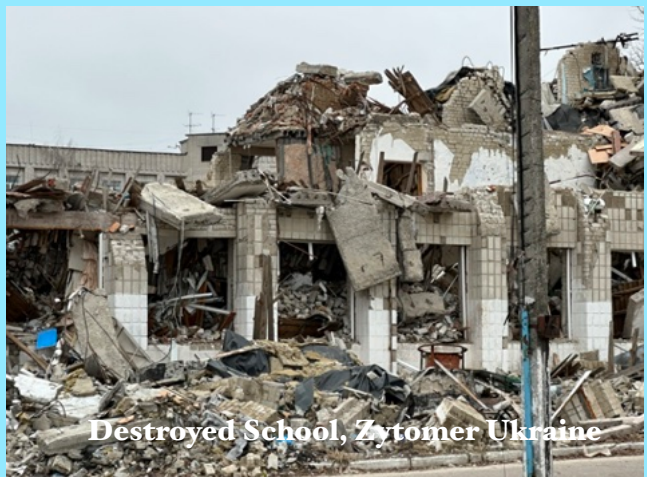
Destroyed School, Zytomer Ukraine