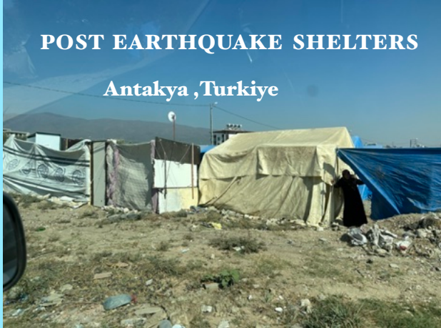
POST EARTHQUAKE SHELTERS