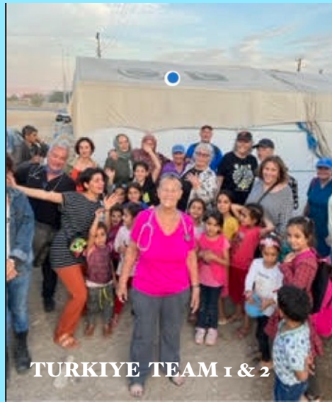
TURKIYE TEAM 1 & 2